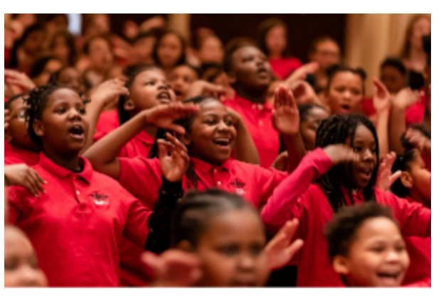
Black History Month Virtual Concert

"Black History Month Virtual Concert: Preserving and Persevering explores how the power of Black music has been the cultural key in both preserving African traditions in America and in helping millions persevere in the face of racial injustice. The dynamic virtual educational program features powerful performances by CCC singers and GRAMMY Award-winning guest artists Lisa Fischer and Ranky Tanky following a behind-the-scenes pre-show of the educational experience leading up to the virtual event."