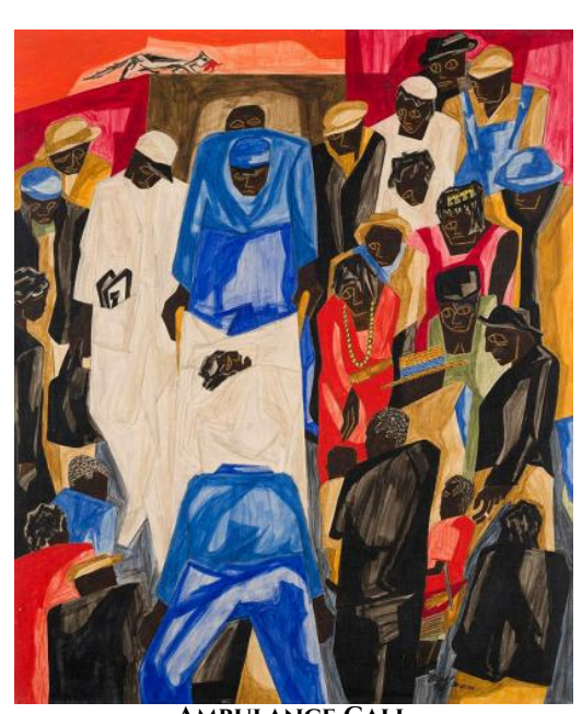
AMBULANCE CALL JACOB LAWRENCE 1948